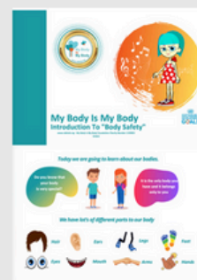
MBIMB Children's Workbook A4 Landscape (2025)