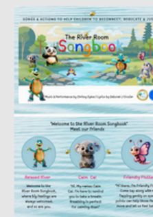
The River Room Songbook

Protecting Children Today, Building Safer Futures Together