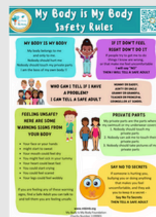
MBIMB Body Safety Rules A4